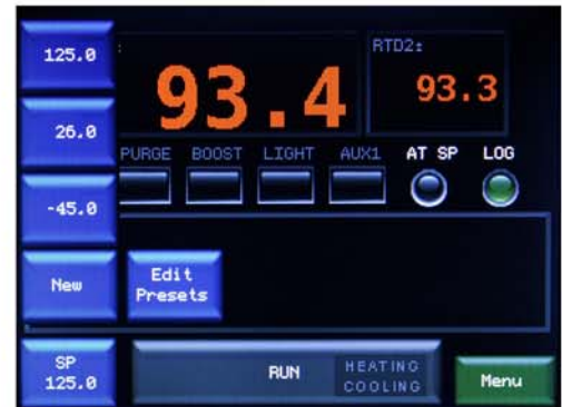
Monitor cycling and performance in real time.

The TS Controller is a new control platform for Sigma Systems' cryogenically and mechanically cooled thermal chambers and plates. Testing of components, sensors, and PCBs typically involves temperature cycling from two to four points, which can be time consuming to setup and run. The TS Controller provides touch-screen and remote interfacing to set up and transfer thermal profiles, view data and trends, and log diagnostics.